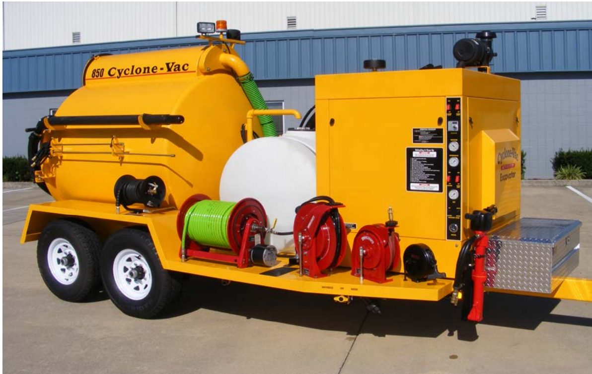
Model 850 Cyclone-Vac